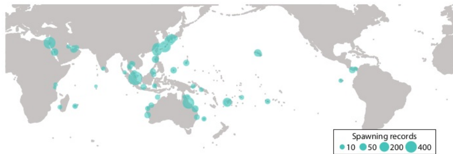
Fig. 1 The number of spawning records by site.